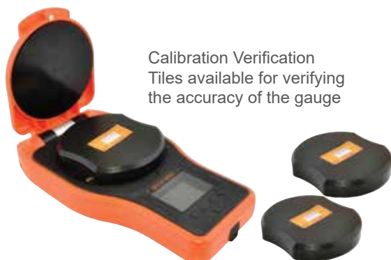
Calibration Verification Tiles available for verifying the accuracy of the gauge